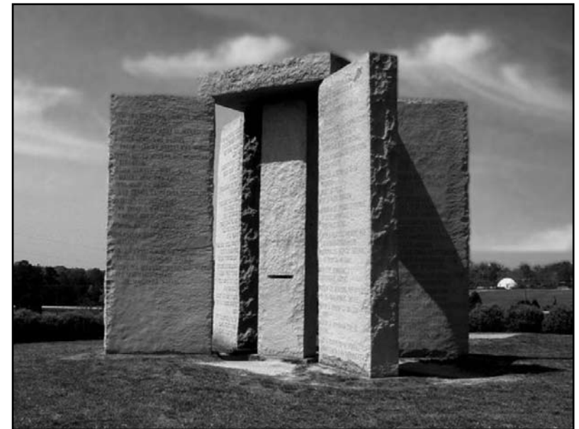
The standing megaliths of the Georgia Guidestones

After nine months of intense work on the part of Elberton Granite and Finishing, the Georgia Guidestones were unveiled to a crowd of 400 people on March 22, 1980. The main structure of this impressive site is composed of four massive granite monoliths, each weighing around 20 tons, and a 9-ton central pillar, all of which support the square 11-ton ‘capstone’. The completed monument stands some 19 feet (just under 6 meters) high. Perhaps taking a lesson from the discovery of the Rosetta Stone (an inscription in multiple languages which facilitated the decoding of the Ancient Egyptian hieroglyphs), the four Pyramid-Blue granite side-slabs are etched with 4000 individual characters, which present the ‘guide’