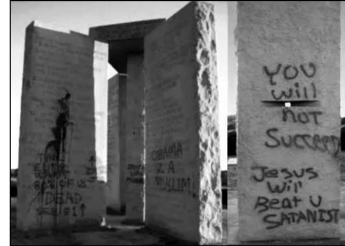
Vandalism on the Georgia Guidestones

In the past year vandals have spray-painted messages across the inscriptions, and splashed the slabs with polyurethane, which makes cleaning the graffiti a difficult proposition. Messages on Internet forums suggest a petition to have them destroyed, and even debate whether it would be illegal to take it upon themselves to do the