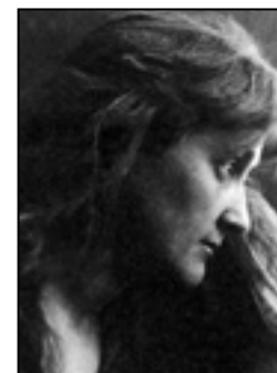
Leonora Piper in 1890